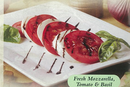
Fresh Mozzarella, Tomato & Basil