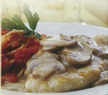
Chicken Scallopini Marsala